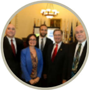
ASCE volunteers worked, with help from ASCE staff, to release 8 state and local Infrastructure Report Cards in 2014 that have received unprecedented media coverage in their communities.

From media interviews to billboards to legislative events, 100+ ASCE members volunteered with our Report Card efforts.