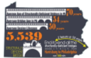
PA Report Card uses graphics to tell the story behind the grades